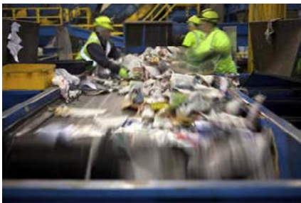
The A846 can be mounted as decentral drive to conveying systems